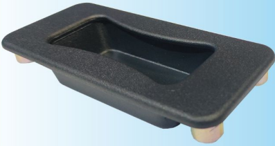
3D Rendered View